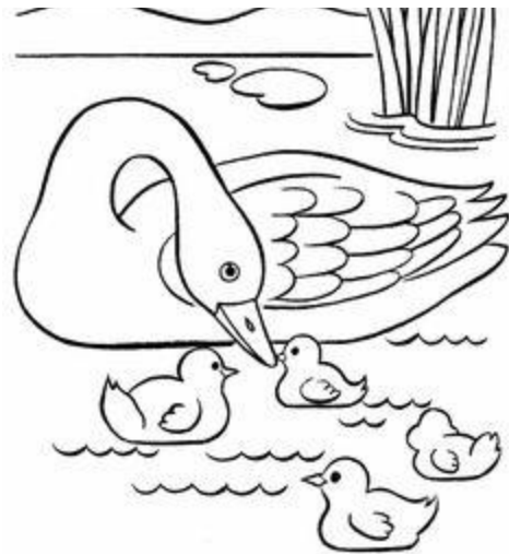
A swan on a river - look in the exhibition space for birds in the water