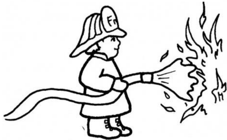
A fire fighter - there are lots of things to do with Market Harborough Fire Station somewhere - can you find them?