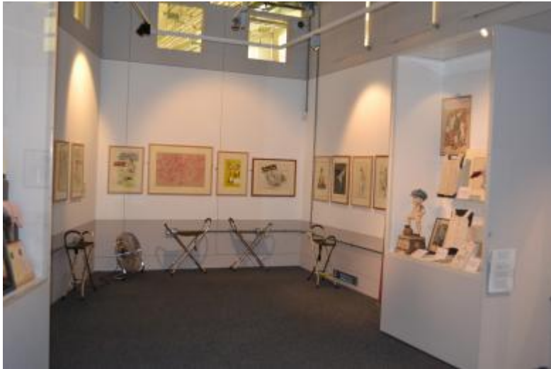
This photo shows the end of the exhibition room.