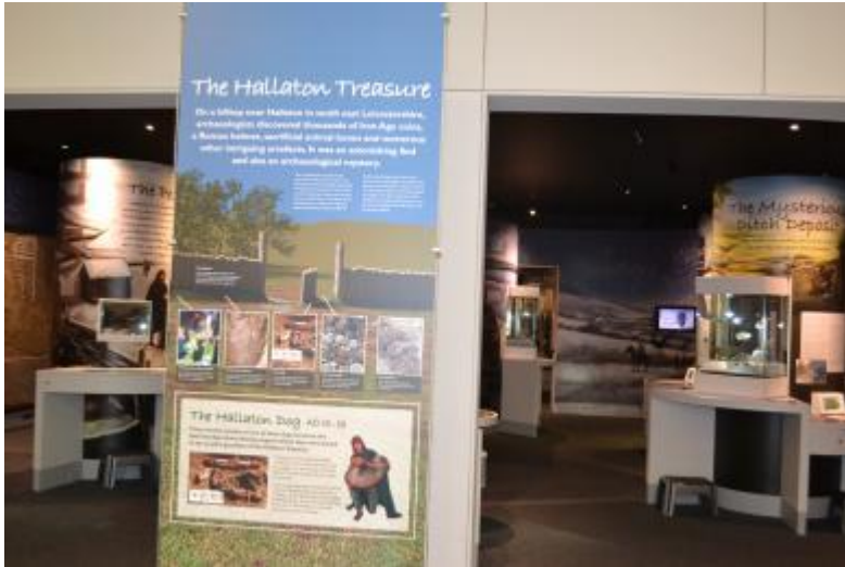
This photo shows a close up of the entrance to the Hallaton Treasure gallery.