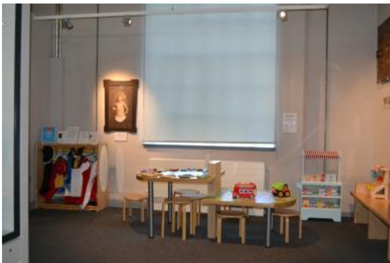
This photo shows the children's play area in the Heritage gallery.