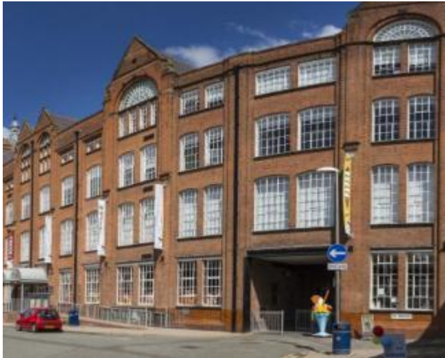
The front of The Symington Building