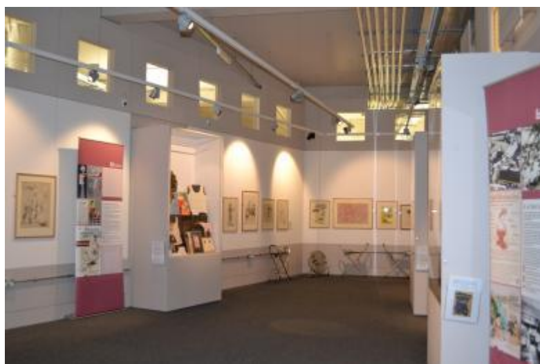
This photo shows the whole of the exhibition room.