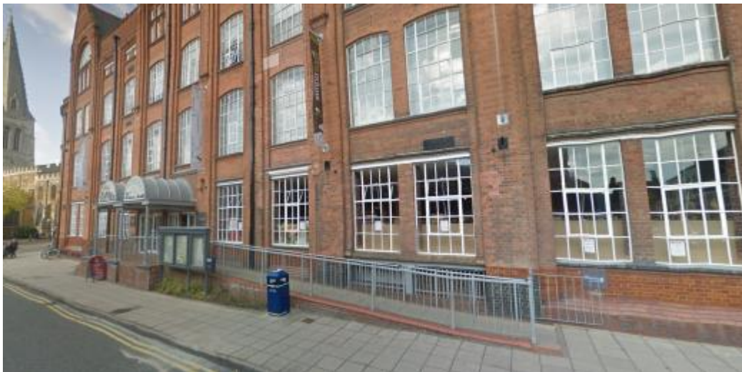
A photo of the ramp leading towards the main entrance, viewed from the street.