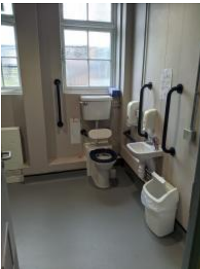
The accessible toilet, sink and grab rails.