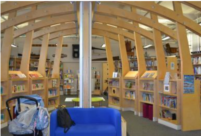
This photo shows the Story Place, a seated area under a wooden arch filled with children's books.