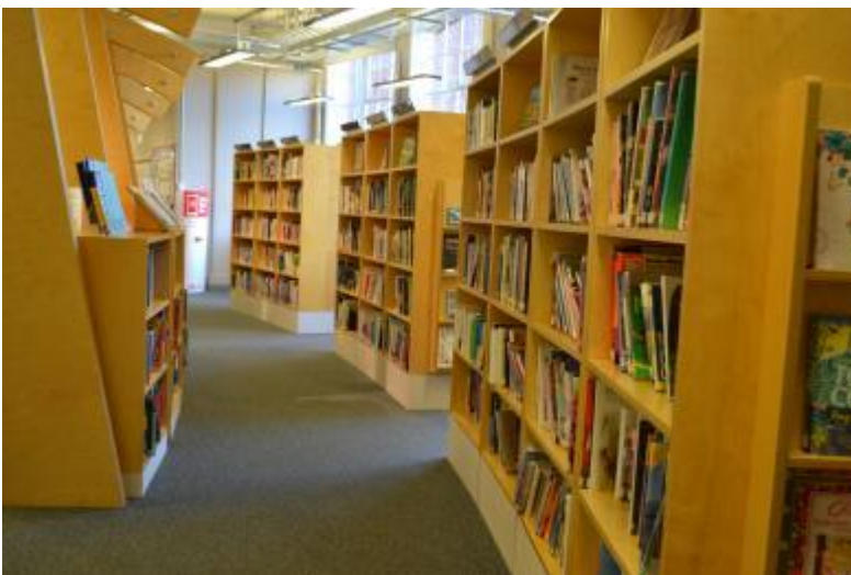
This photo shows one of the paths in the library with bookshelves either side.