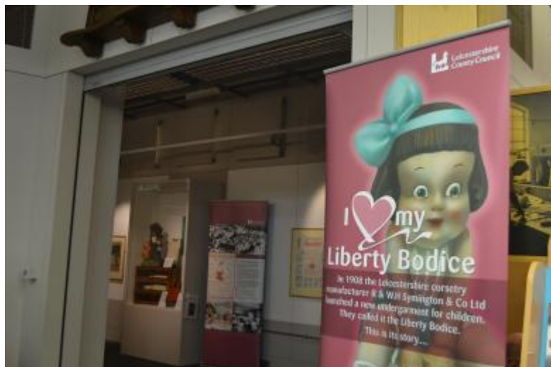
This is a photo of the exhibition entrance.