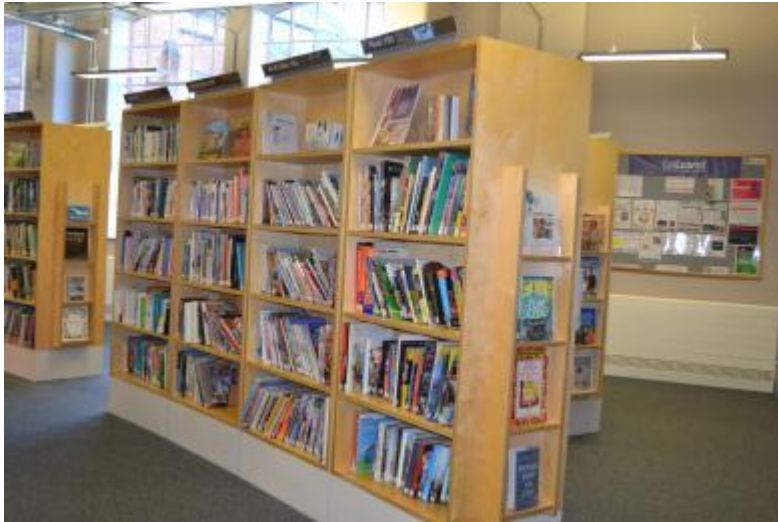
This photo shows one of the bookshelves in the library.