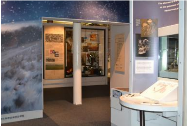
This photo shows the entrance to the Heritage gallery. There is a pole in the middle of this entrance.