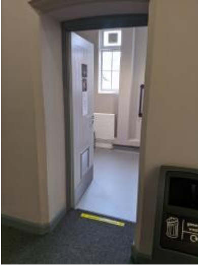
The entrance to the accessible toilet.