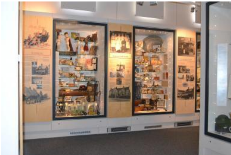
This photo shows some of the displays in the Heritage gallery.