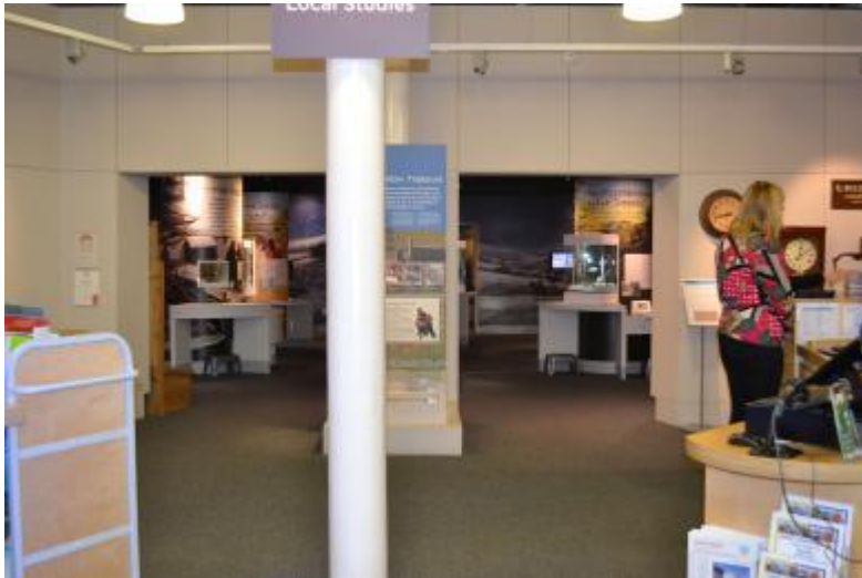
This photo shows the entrance to the Hallaton Treasure gallery, between the two help desks. There is a column in the middle.