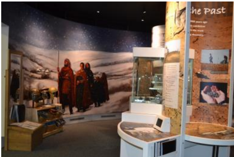
This photo shows the left side of the Hallaton Treasure gallery, which is dimly lit.