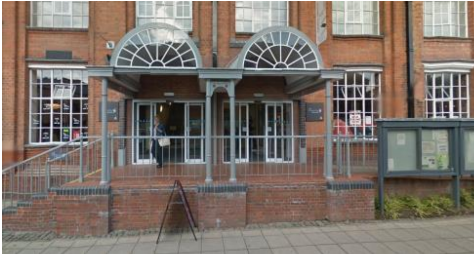
A photo of the automatic doors at the main entrance, viewed from the street.