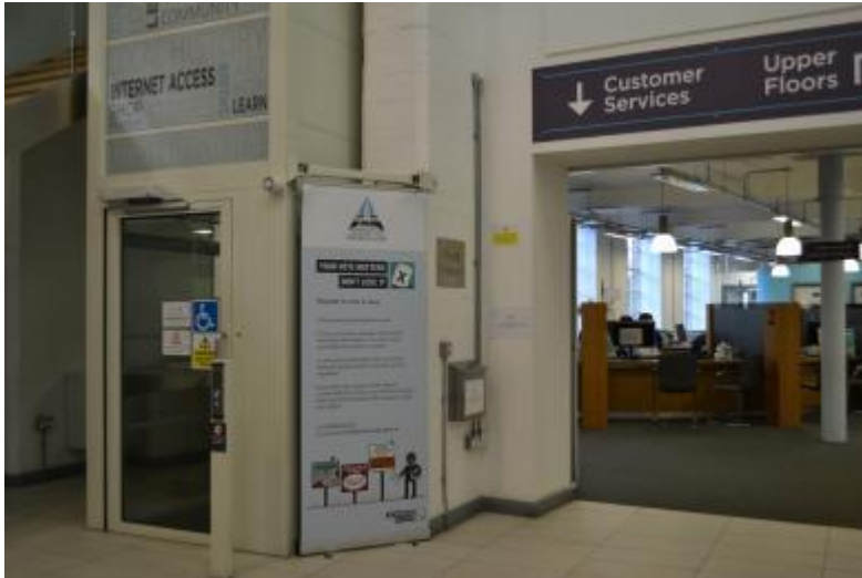
The route to the platform lift on the ground floor.