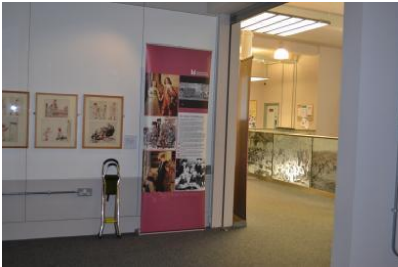
This photo shows the exit of the exhibition which is the same door as the entrance, taken from inside the exhibit.