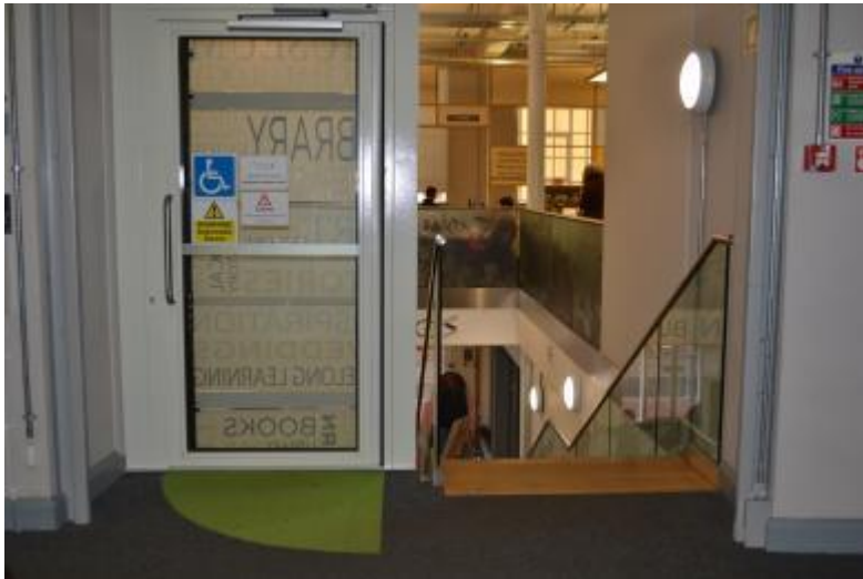
a photo of the platform lift next to the stairs, viewed from the first floor – the highest floor the lift can go to.